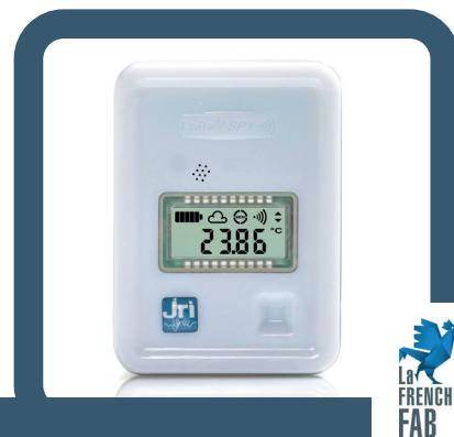
Non contractual photo

Temperature and hygrometry recorder with a long-range LoRaWAN™ connectivity